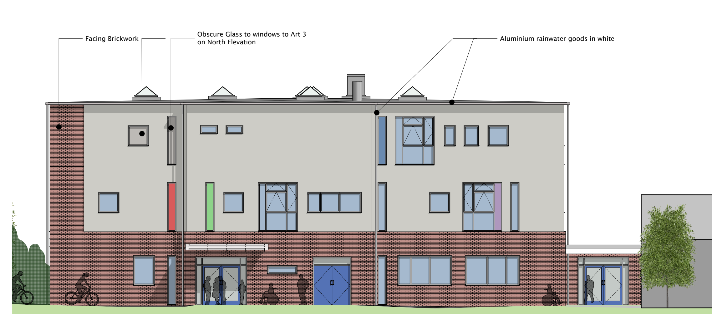
New Extension North Elevation