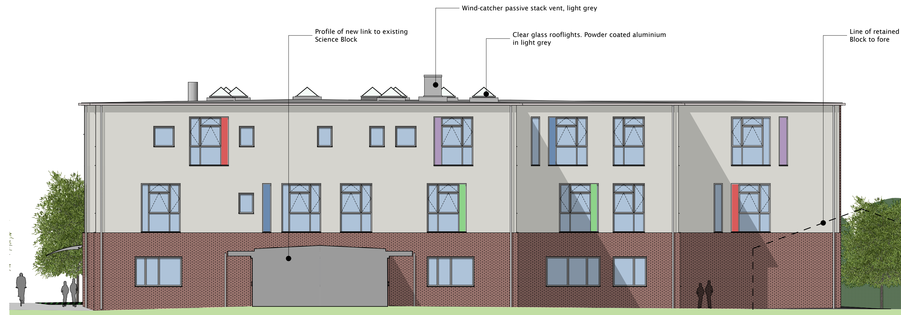
New Extension West Elevation