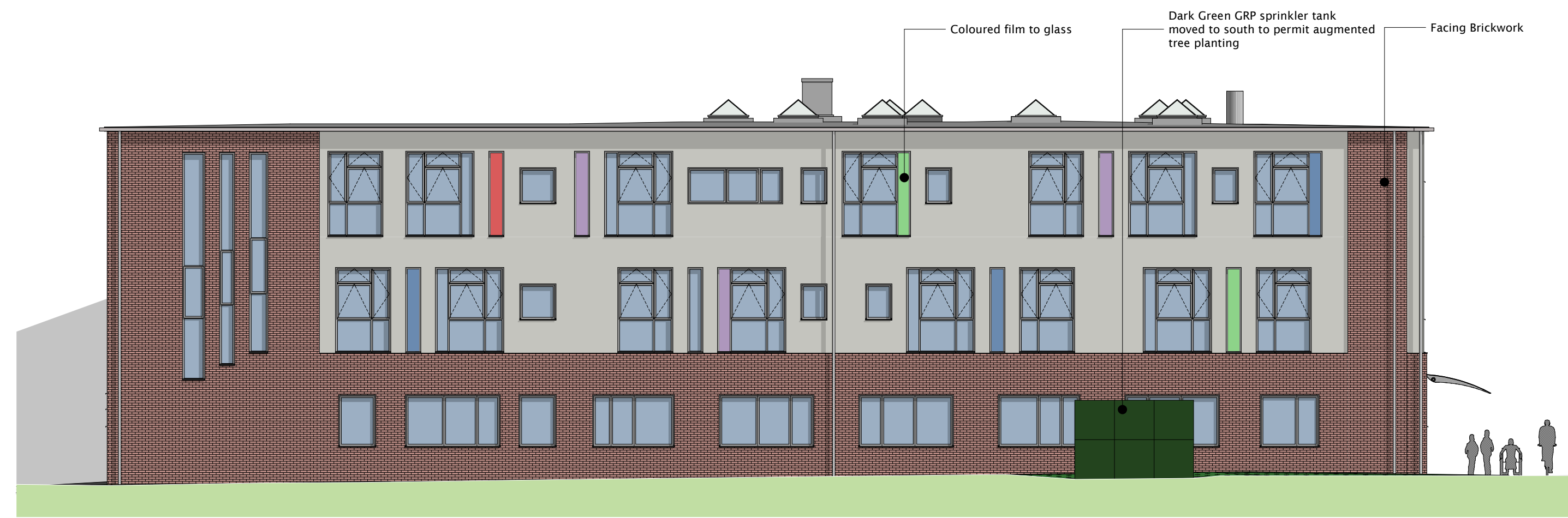
New Extension East Elevation