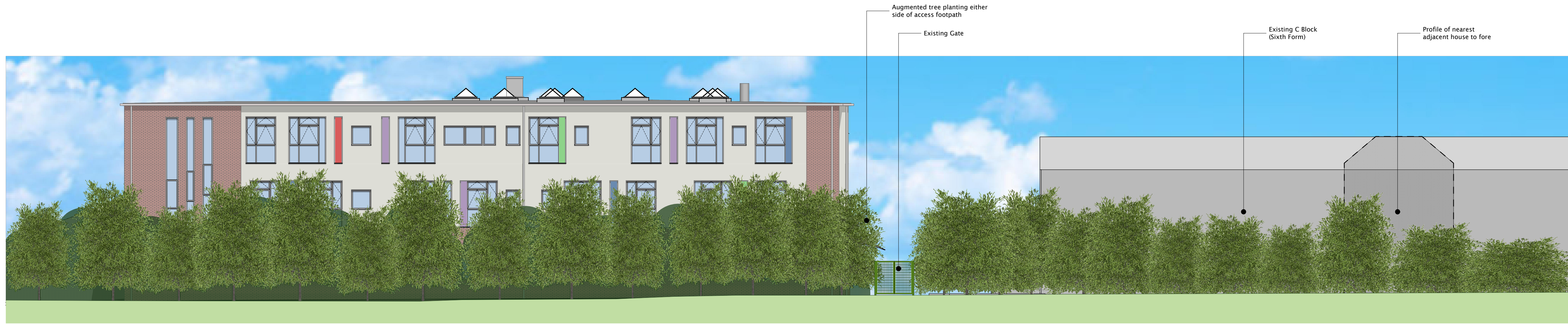
Context East Elevation