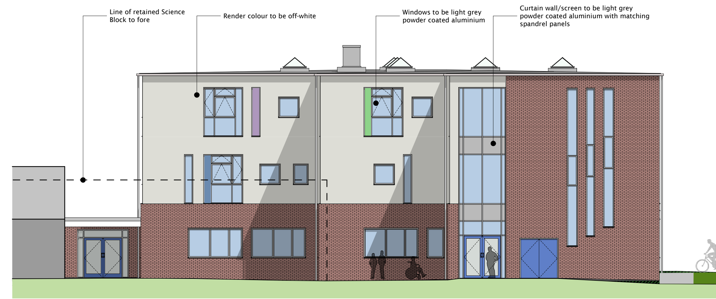
New Extension South Elevation